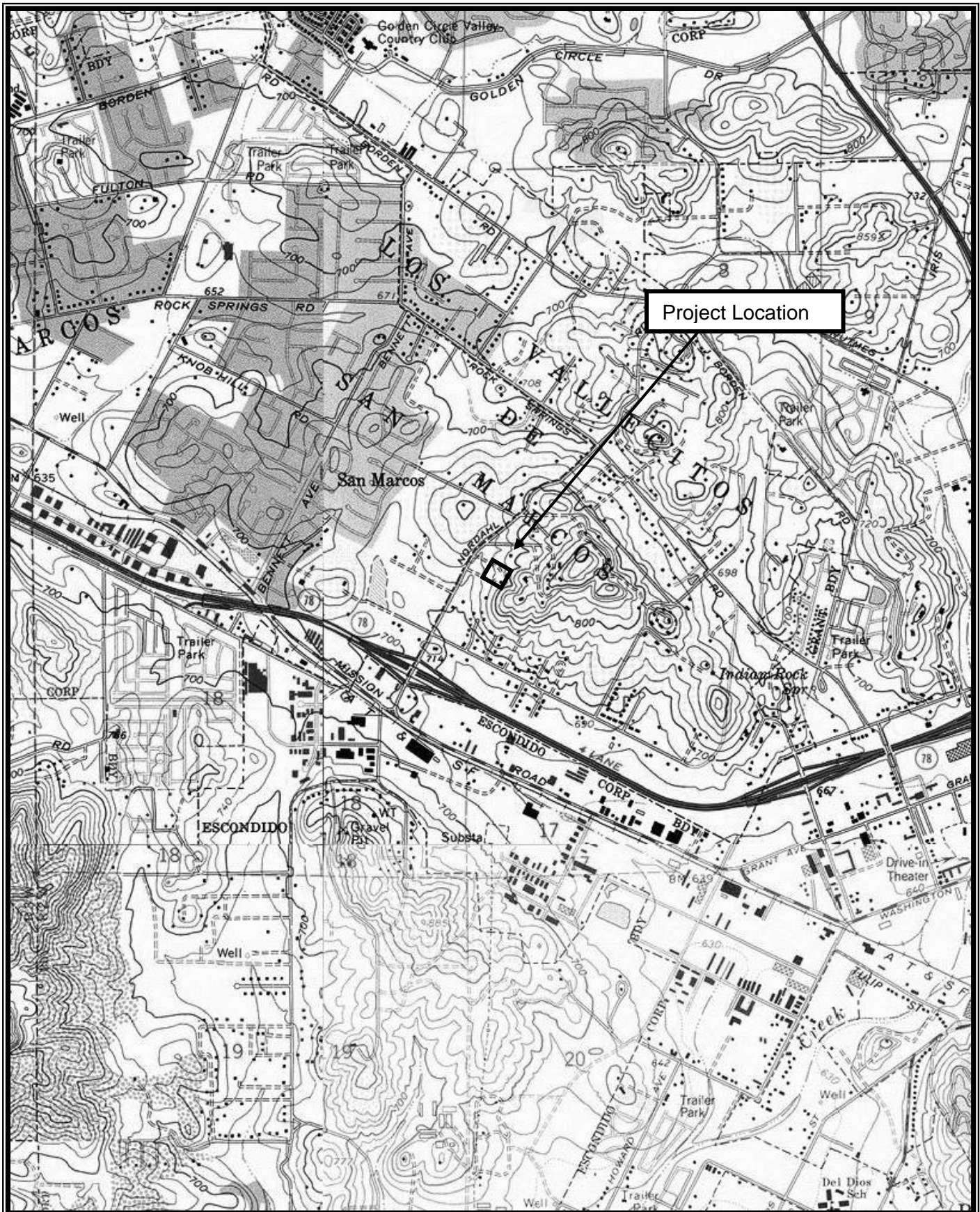
FIGURE 2: PROJECT LOCATION: SAN MARCOS, VALLEY CENTER, RANCHO SANTE FE, and ESCONDIDO U.S.G.S. 7.5-MINUTE MAPS