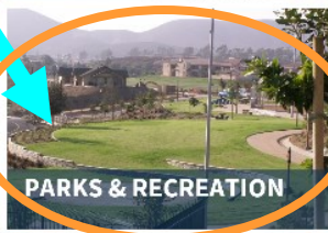
PARKS & RECREATION